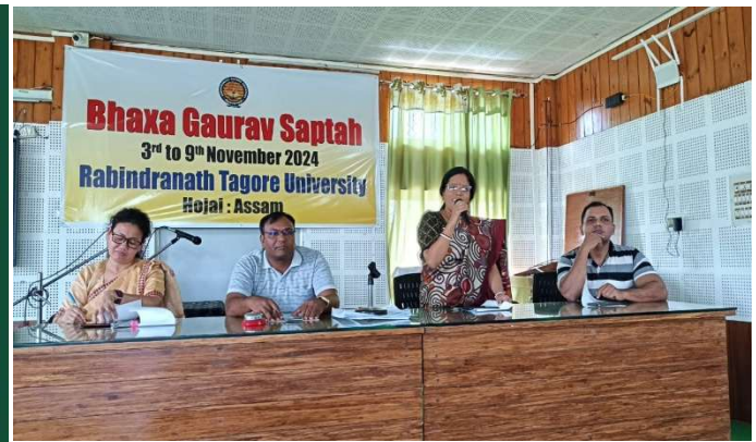
Judges of Speech & Letter Writing Competition