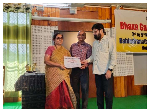
Prize distribution in the valedictory function